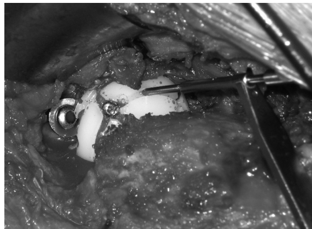
Fig. 3. Fixing the inverted cup onto the cemented cup with screws at the border of both cups