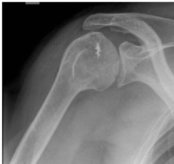
Fig. 3. Post-operative radiograph showing improved joint contour following arthroscopic tuberoplasty

abduction had markedly improved from a maximum of 60 degrees pre-operatively to 110 degrees post-operatively.