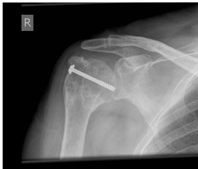
Fig. 1. Initial post-operative radiograph following cannulated screw fixation of the greater tuberosity without adequate reduction; the tuberosity is malunited in a superiorly migrated position

Nine months post-operatively, a marked improvement in range of movement was evident; forward flexion had increased by 30 degrees and the range of