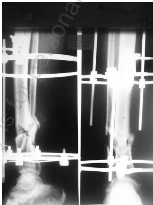
Fig. 2. Showing the radiograph of the docked site

The functional result was based on five criteria: a noteworthy limp, stiffness of adjacent joints (loss of more than 15° of motion), soft tissue sympathetic dystrophy (RSOD), pain that reduced activity or disturbed sleep and inactivity. The functional result was considered excellent if the patient was active and none of the other four criteria were applicable, good if the patient was active but one or two of the other