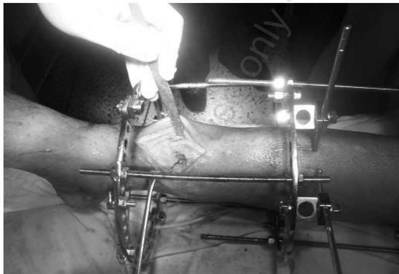
Fig. 4. Intra operative view of the invaginating docking

criteria were applicable, fair if the patient was active but three or four of the other criteria were applicable and poor if the patient was inactive [1].