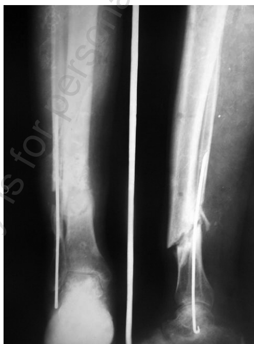
Fig. 1. Pre operative radiograph of the infected distal tibial non union

The application of the technique necessitated a minute and detailed study of the radiographs of the involved bone taken in the anteroposterior and lateral planes (Fig. 1). The bone ends were classified as per the classification of Schwartzmann et al. [5]. Only those cases where at least one of the two main fragments was rhomboidal, pencil like or trapezoidal were included in this study. This was done to prevent undue resection and sculpting during the surgical procedure. The Ilizarov frame was constructed pre-operatively to save operating time.