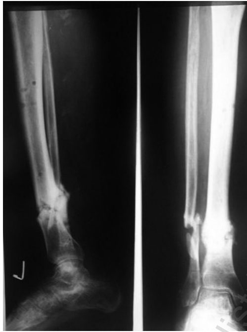
Fig. 3. Showing union at the docking site